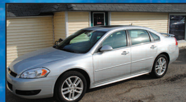
2014 CHEVY IMPALA LTZ Power sunroof, OnStar, Bluetooth, leather. Only 13 K miles. AS LOW AS $295 A MONTH