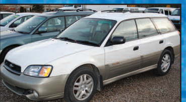
2001 SUBARU OUTBACK LEGACY AWD, 131 K. Great for winter. SALE PRICE $6,495