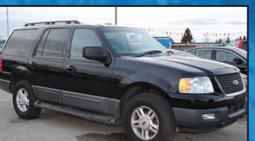
2006 FORD EXPEDITION XLT 4WD, 3rd row seat. SALE PRICE $8,497