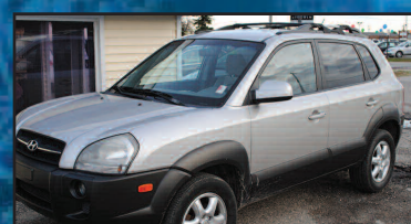
2005 HYUNDAI TUCSON 4WD, nice vehicle, 102 K. SALE PRICE $8,995