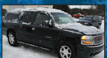
2003 GMC YUKON XL 4WD Denali pkg, 3rd row seat, tow pkg, DVD. AS LOW AS $199 A MONTH

989 VFW RD., CHEBOYGAN, MI • 231-627-6700 • WWW.RIVERAUTO.NET