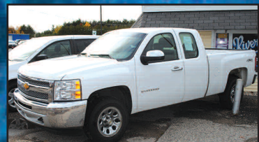
2012 CHEVY SILVERADO LS 4x4, one owner, tow pkg, seats 6. AS LOW AS $249 A MONTH