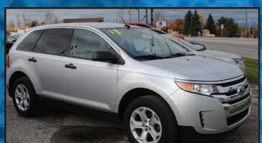
2013 FORD EDGE AWD. This is one of the nicest SUV's we have seen. AS LOW AS $274 A MONTH