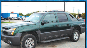
2002 CHEVY AVALANCHE. Z-71 4x4, leather, tow pkg, bedliner, cover. AS LOW AS $199 A MONTH