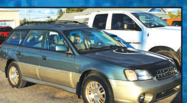
2002 SUBARU OUTBACK WAGON H6-3.0. AWD, leather, sunroof, nice shape. AS LOW AS $149 A MONTH