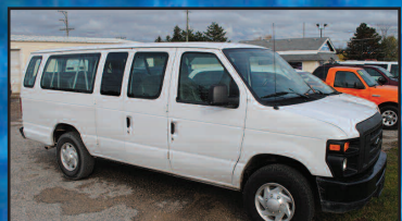
2011 FORD E-350 XL SUPER DUTY VAN 15 passenger, advance-trac, flex fuel, 69 K. SALE PRICE $16,900.