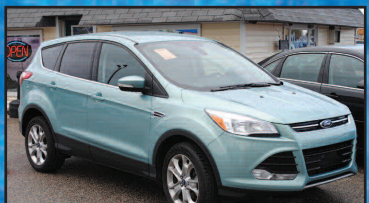
2013 FORD ESCAPE SE EcoBoost, Sync, all the goodies on this black beauty. AS LOW AS $224 A MONTH