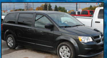
2012 DODGE GRAND CARAVAN Slow-N-Go, one owner, 51 K. AS LOW AS $259 A MONTH