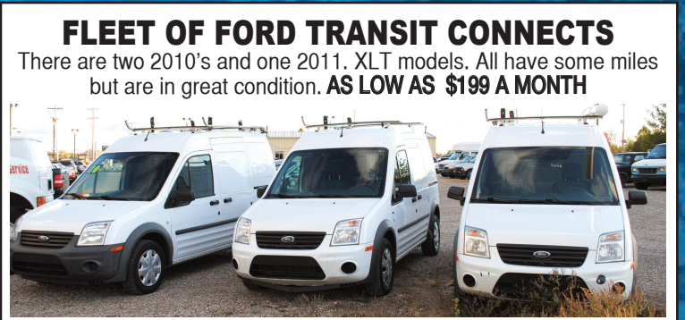
FLEET OF FORD TRANSIT CONNECTS There are two 2010's and one 2011. XLT models. All have some miles but are in great condition. AS LOW AS $199 A MONTH