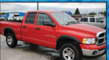
2005 DODGE RAM 1500 SLT 4x4, 4 door, seats 6. AS LOW AS $199 A MONTH