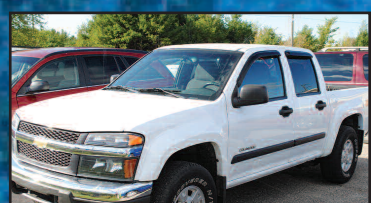
2005 CHEVY COLORADO LS Z-71, 4x4, 4 door, tow pkg. AS LOW AS $249 A MONTH

We need room for new inventory immediately!