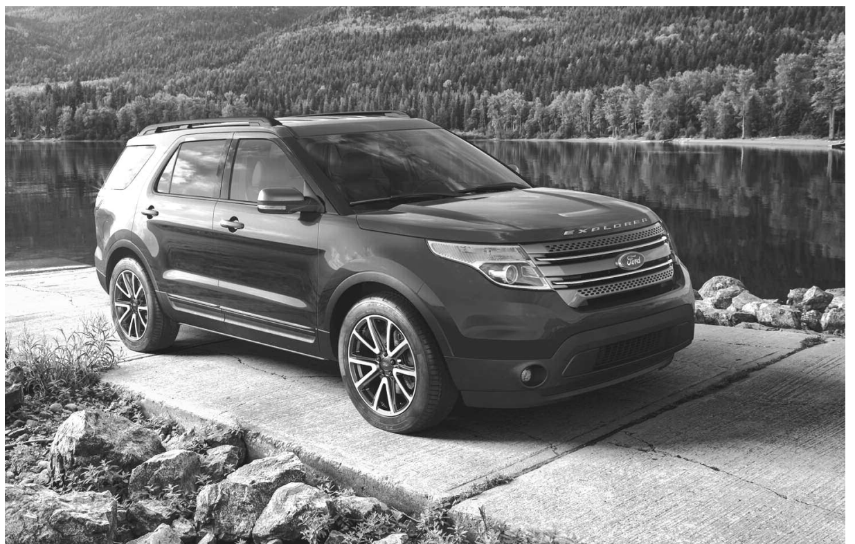
Ford Motor Company announced the 7-millionth Explorer sold in the United States today, sealing the vehicle's position as America's favorite SUV.