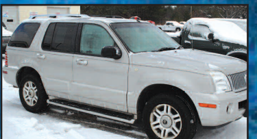
2003 MERCURY MOUNTAINEER AWD, leather, V-8, sunroof, tow pkg. Hard to find 3rd row seat. AS LOW AS $199 A MONTH