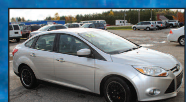
2012 FORD FOCUS SE One owner, 38 MPG. Like new. AS LOW AS $169 A MONTH