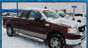
2006 FORD F-150 4x4, bedliner, tow pkg, 5.4 Triton, Club cab, seats 6. AS LOW AS $199 A MONTH