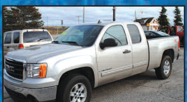
2008 GMC SIERRA SLE Z71 4x4, bedliner, tow pkg. Nice, nice truck! AS LOW AS $249 A MONTH